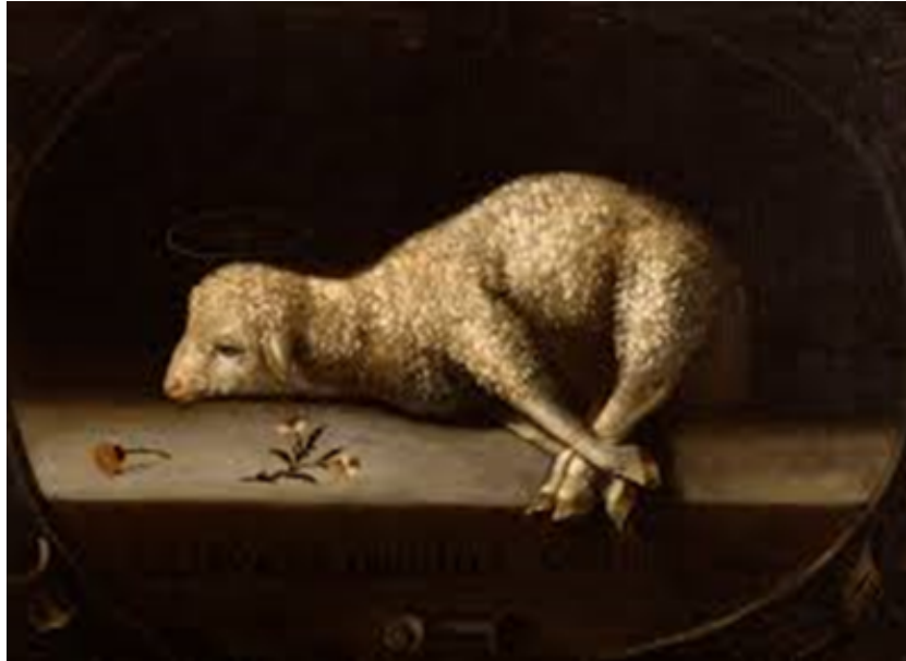
The Sacrificial Lamb by Josefa de Ayala (ca. 1630-1684)

The first example he gives of this is Adam and Eve. In the garden, their sin caused them shame, and they recognized their nakedness. This was suffering enough for Adam and Eve